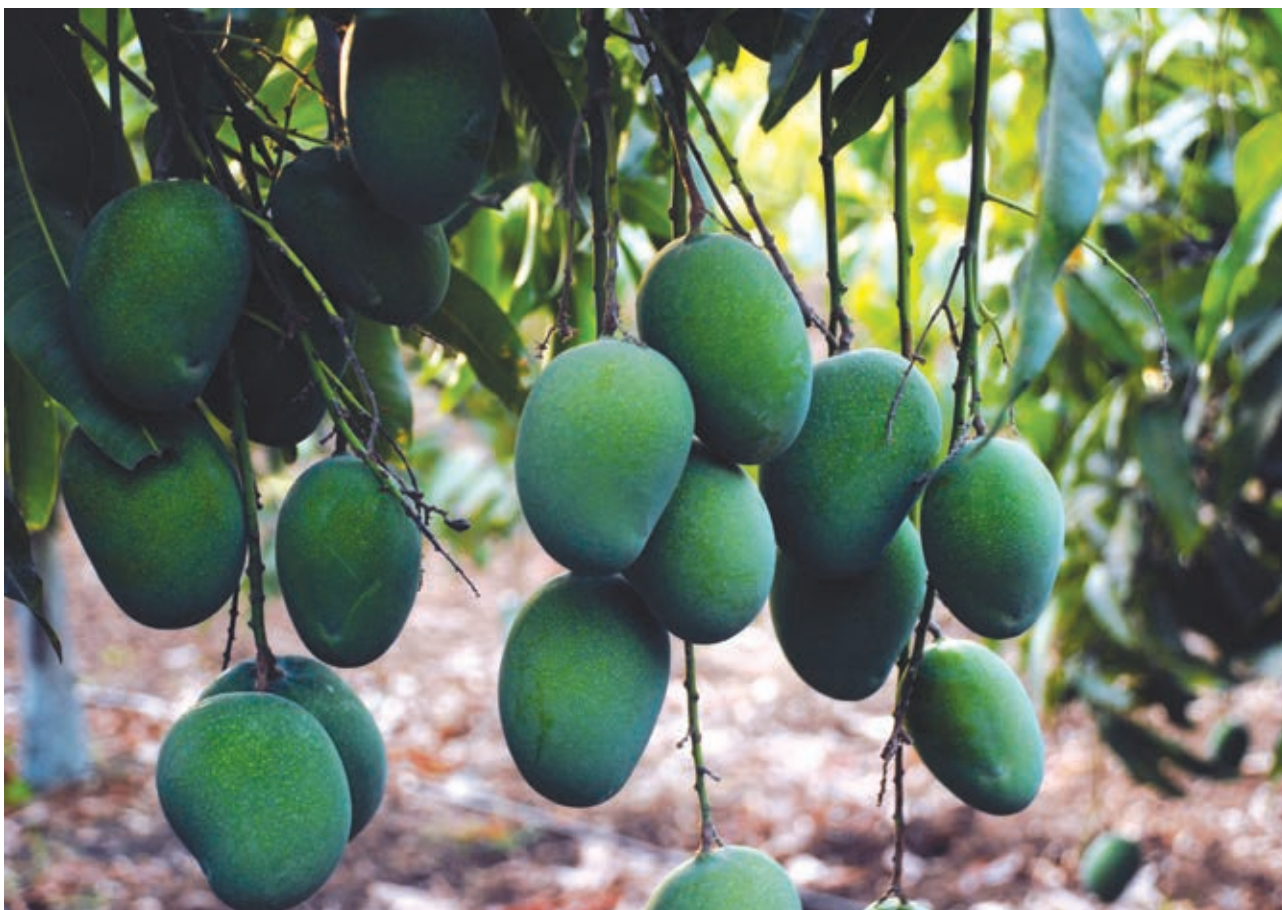
Attempt to cover maximum agriculture sourcing under JAINGAP

We are also looking toward the implementation of JAINGAP for the mango plantations.