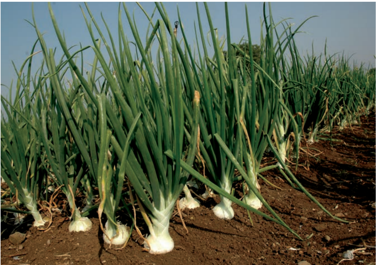
Onion under sprinkler irrigation